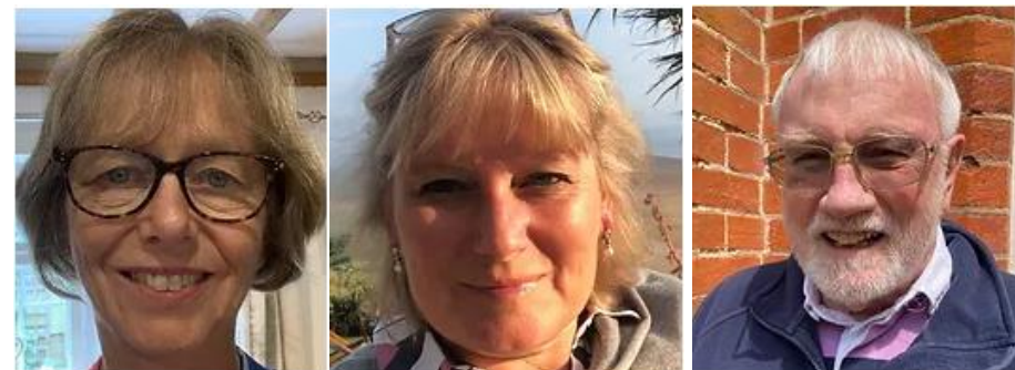
The OWW Safeguarding Team

The Diocese has introduced an online Parish Dashboard, ensuring we record a review of our safeguarding policies, practices and risk assessments as a minimum annually.